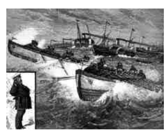
Insert: The Admiral watching the contests.

We notice elsewhere the Naval Regatta, which was held in Hobson's Bay on February 11. The race delineated by our artist is the Cutter Race, in which there were eight boats engaged. The Cerberus men came in winners, and the Nelson were second, the crews of the Russian men-of-war making but a very poor show in the race. In our engraving the Cerberus men are leading, and the Nelson boat second. The official times taken as the boat passed the flagship will show the close positions of the first four boats.