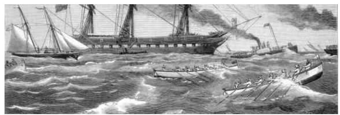
Illustrated Australian News, February 22 1882

6. Race for Man-o-war and Naval Reserve Cutters. 12 oars. Prize presented by the Victorian Yacht Club. Course- From the Sandridge Town pier to the lightship. This was the race of the day. One of the principal features of this race was the appearance of the eight crews as they waited the signal to start with the oars on end in the usual man-o-war style, and the instant the gun was fired being dropped into the rowlocks, a splendid struggle again taking place between the crews of the Cerberus and the Williamstown and Sandridge Naval Reserves, the Russian crews being as in the other races left far in the rear. All the boats got well away at the start, the Cerberus and the Nelson rowing stroke and stroke for more than half the course, very closely followed by the two Reserve crews, the others gradually dropping behind. Greater pluck and determination were never witnessed in a boat race. Every man in the boats appeared to exert himself to the utmost, and notwithstanding the heavy sea and strong wind against them. The form displayed was remarkably good, the swing and the dip of the oars being as regular as clockwork. The official times taken as the boats passed the flagship will show the close positions of the first four boats:—