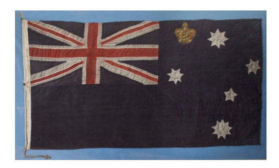
Figure 18 - Victorian Ensign taken to China.

the Southern Cross , on the Yung-ting Ho river, and saluted by 100 French cavalry on passing the town of Tsin-ah-Sha.